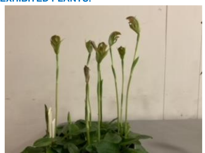
Pterostylis curta Exhibitor: C Wong