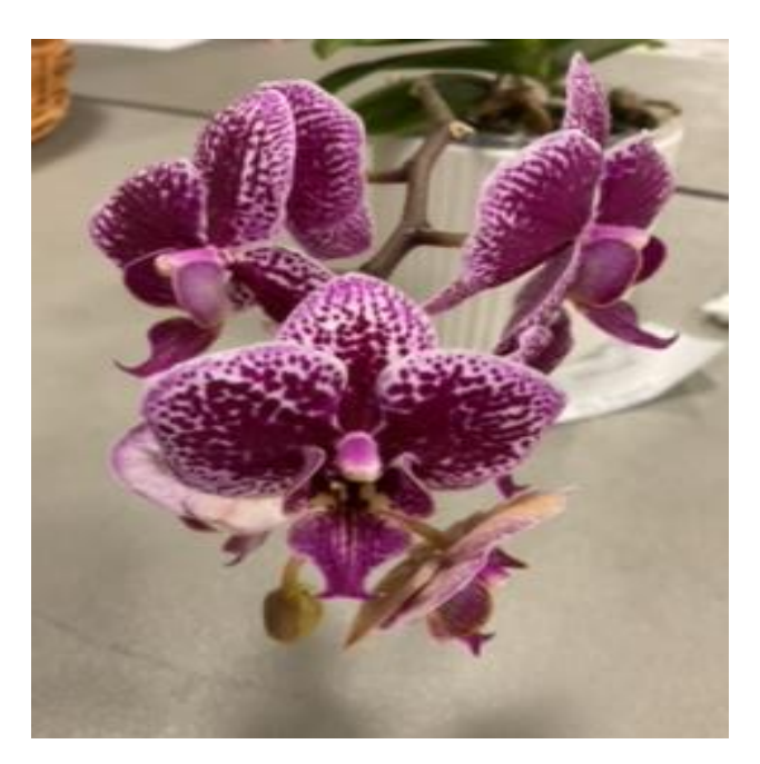
Phalaenopsis Unknown Exhibitor: L Huang