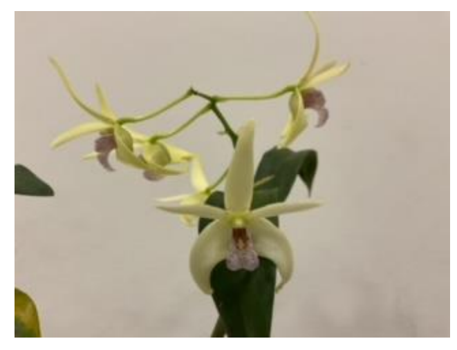
Dendrobium Allyn Star x (Den. Pinterry x Riversun) Exhibitor: C Wong