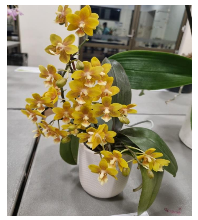
Phal. KS Balm Yellow Chocolate Exhibitor: Yopi Lim