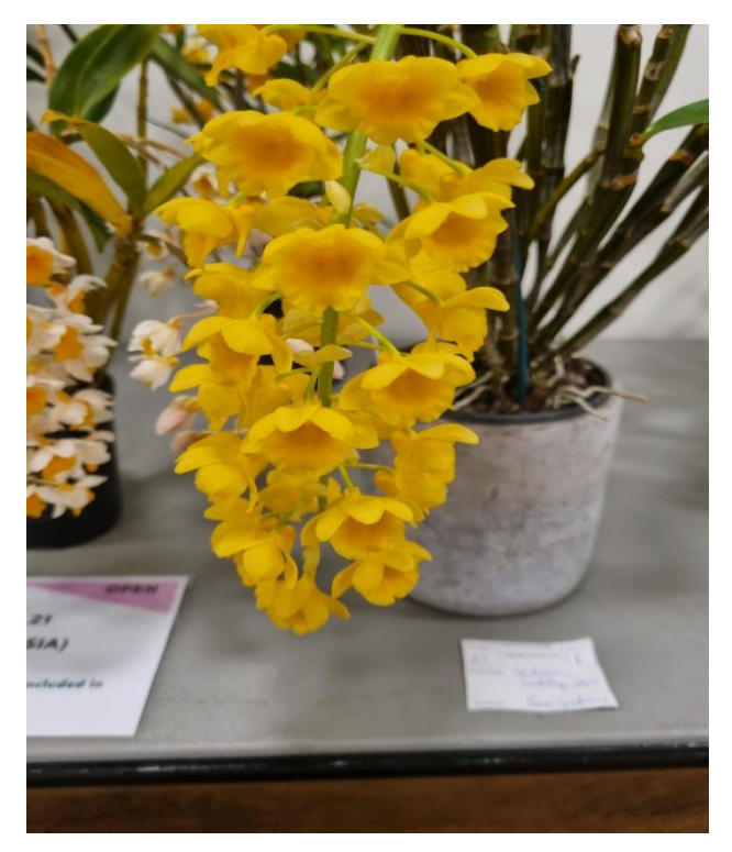
Dendrobium densiflorum Exhibitor: R Trethewy