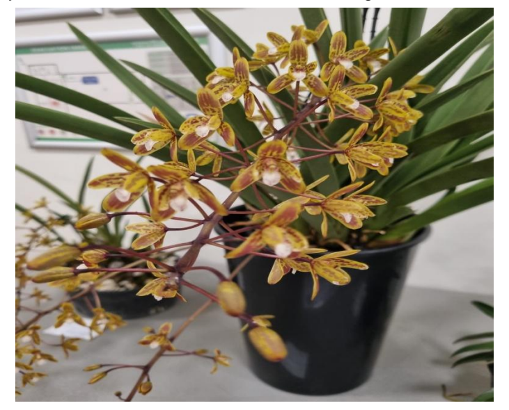
Novice Class Plant of the Night Phalaenopsis Gan Lin Pearl Exhibitor: Lily Huang

Open Class Plant of the Night Cymbidium canaliculatum. Exhibito r: C Wong