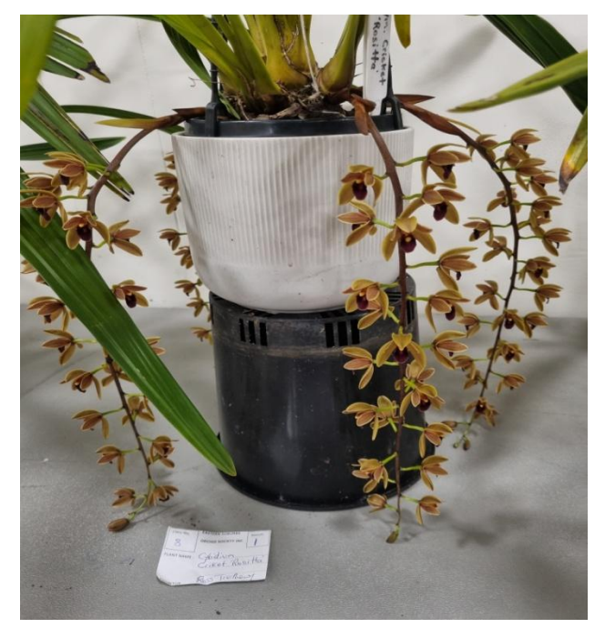
Cymbidium Cricket Rosita Exhibitor: R Trethewy