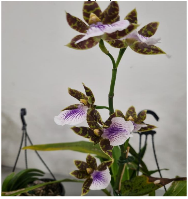
Zygopetalum mackaii Exhibitor: R Trethewy