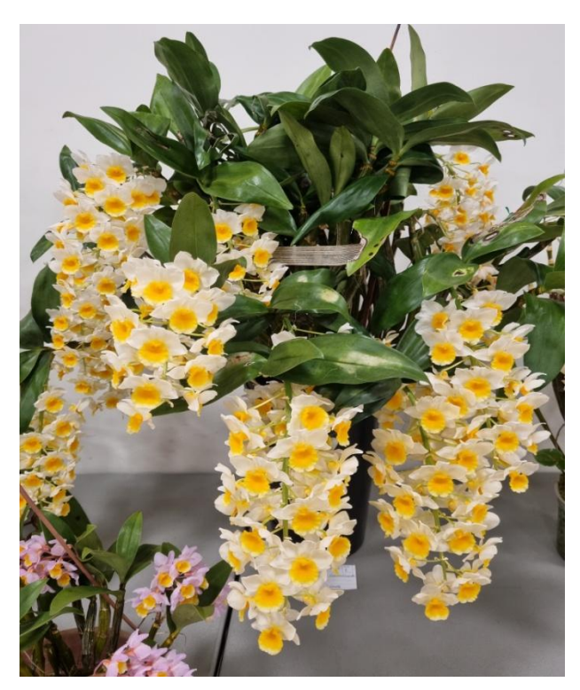
Dendrobium Cream Cascade Exhibitor C Wong (Peoples' Choice)