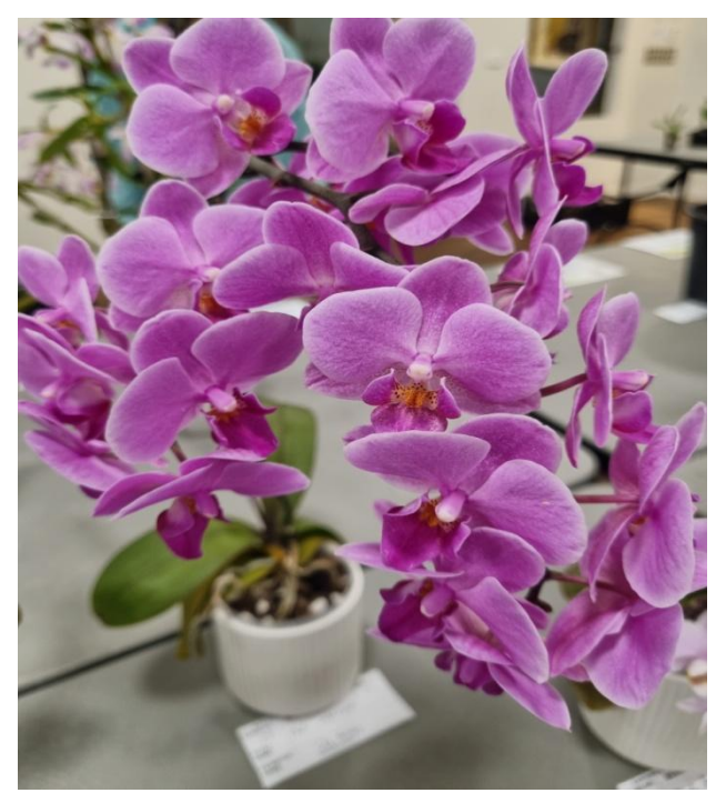
Phal. unknown Exhibitor: L Huang