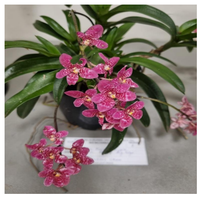
Sarc. Kulnura 'Ripple' x Sarc. Bunyip 'Big Edge' Exhibitor: H Chen